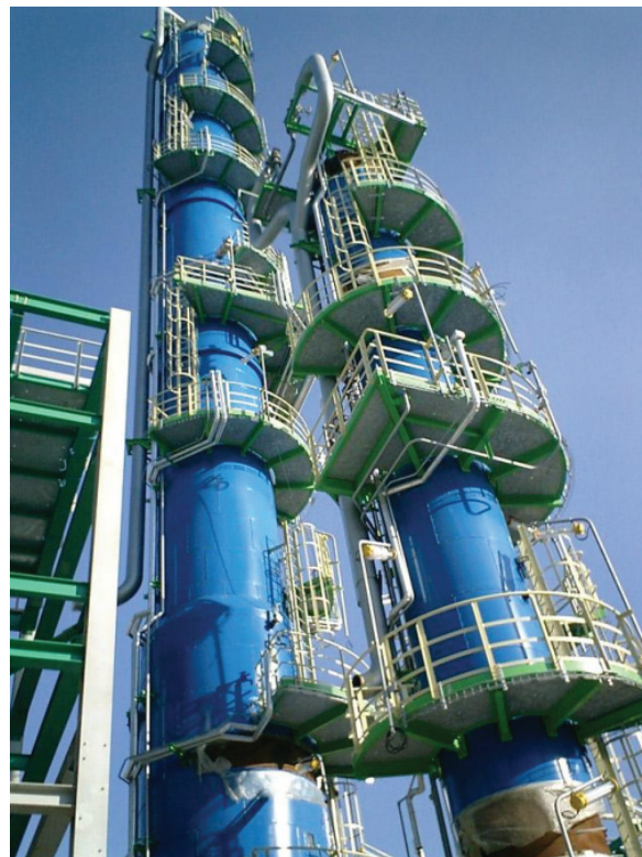
Figure 1. Gas Rectification Columns

The Gas Rectification Columns (presented in Figure 1) operate at a maximum temperature of 100 °C and a pressure, P s , of 7.9 MPa and contain a raw gas and 30% WT DEA.