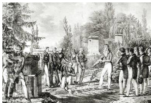
Figure 3. Students of the École Polytechnique at the tomb of Gaspard Monge [31]

The students of the École Polytechnique appreciated their professor profoundly and he was their idol (Monge had protected them from Napoleon's domineering interference). The King prohibited them to attend Monge's funeral. Berthollet held the speech at his funeral, and the following day students went to the cemetery to pay tribute to their master (Fig. 3) [1-4].