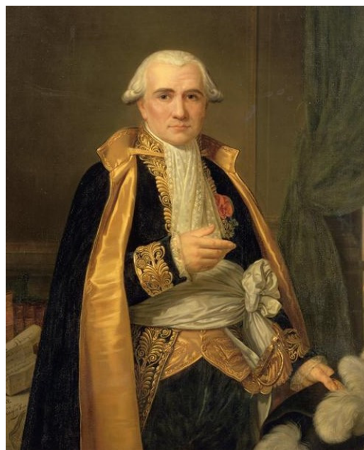
Figure 1. Portrait of Gaspard Monge [29]

projection of its points on two mutually orthogonal planes [3]. This was the very beginning of descriptive geometry and his method was declared secret for more than fifteen years. For the first time, in 1794, he was allowed to teach it at the École Normale in Paris and among the pupils was J. L. Lagrange. Lagrange's reaction to descriptive geometry was the following one "Before hearing Monge I did not know that I knew descriptive geometry" [1-5].