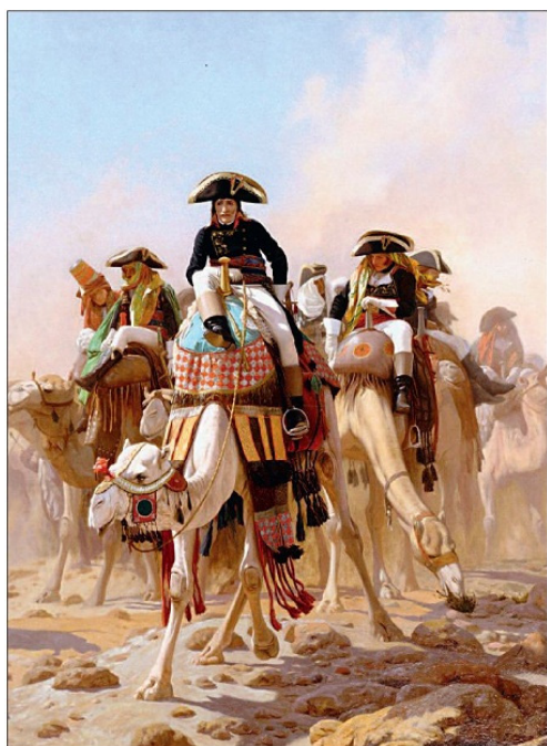
Figure 2. Napoleon in Egypt [30]

After the Egyptian campaign, Napoleon created the Legion d'Honneur in 1802. Lagrange, P. S. Laplace, Berthollet and Monge were proclaimed Grand Officers of the Legion of Honour, Counts and Senators for life. In 1803, Napoleon established a system, in which France was divided into 15 districts for legal appeals. Monge and Berthollet were two of only three scientists selected for these positions [1-4, 10, 11]. When Fourier returned to France from Egypt in 1801, he was appointed by Napoleon as prefect of the Department of Isere, in Grenoble. His administration was outstanding during a 12-year tenure, and Napoleon made him a Baron in 1808. Although Fourier had difficulty in surviving Napoleon's downfall. He was finally appointed Director of the Statistical Bureau of the Seine and elected to the Académie des Sciences [1, 5, 10, 11, 15]. Laplace was named Minister of the Interior by Napoleon, but he was a poor administrator and was replaced by Napoleon after only six weeks in office. Laplace successfully shifted loyalty under numerous changes in regime. After the Bourbon restoration, Louis XVIII raised him to the peerage as the Marquis de Laplace [1, 5, 10, 11, 15, 16].