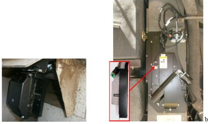
Figure 1. a- Gape between elevator and auger for clear grain and impact plate of mass flow sensor with modul (view from grain tank) and b - grain moisture sensor [10]

On the basis of this force, as well known to the width of the developer, the speed of movement and the speed of the elevator to the grain, as well as the percent of moisture, calculated on the weight of dry yield of grain. The effect of vibration harvester was eliminated the previous calibration mass sensor [9]. It is also pre-calibrated sensor and moisture content. System for the measurement of the yield is configured to successively records data on every two seconds. This is the time interval measurement, which was constant. Changing only the distance traveled during this time which is dependent on the speed of the combine and also was scored for each time interval of two seconds. If the recording interval in the range of 1-3 s, generate very large data sets, even for small fields [8]. The system for measuring grain yield is adjusted to successively record data at 2-second intervals. This was a constant time interval of measuring. The only parameter that changed was the distance travelled during that time, depending on the combine speed and was also recorded at 2-second intervals. The recording of measurements at 1-3 second intervals generates large datasets, even for small fields [8].