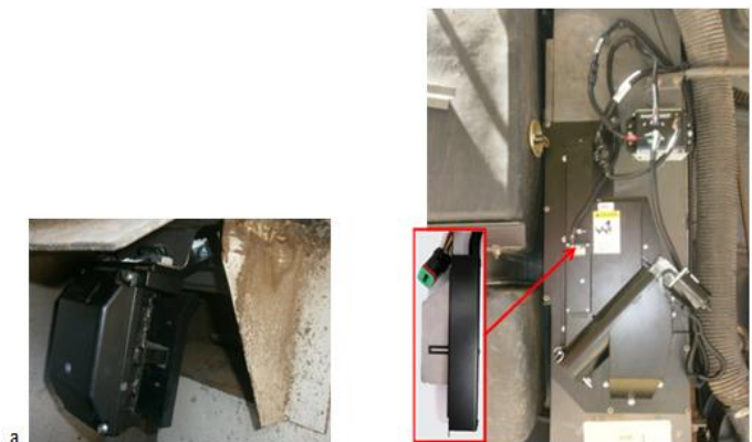
Figure 1. a- Gape between elevator and auger for clear grain and impact plate of mass flow sensor with modul (view from grain tank) and b - grain moisture sensor [10]

On the basis of this force, as well known to the width of the developer, the speed of movement and the speed of the elevator to the grain, as well as the percent of moisture, calculated on the weight of dry yield of grain. The effect of vibration harvester was eliminated the previous calibration mass sensor [9]. It is also pre-calibrated sensor and moisture content. System for the measurement of the yield is configured to successively records data on every two seconds. This is the time interval measurement, which was constant. Changing only the distance traveled during this time which is dependent on the speed of the combine and also was scored for each time interval of two seconds. If the recording interval in the range of 1-3 s, generate very large data sets, even for small fields [8]. The system for measuring grain yield is adjusted to successively record data at 2-second intervals. This was a constant time interval of measuring. The only parameter that changed was the distance travelled during that time, depending on the combine speed and was also recorded at 2-second intervals. The recording of measurements at 1-3 second intervals generates large datasets, even for small fields [8, 12].