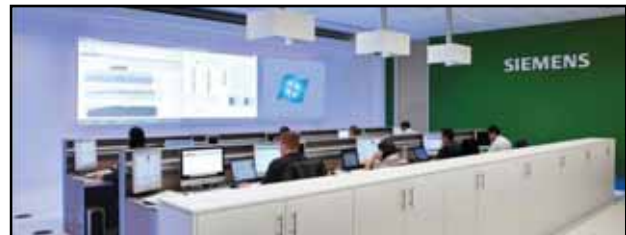
Figure 2: Monitoring of production from the Data Center [09]

Today, with the application of control technology in the form of optical, electrical and temperature sensors as well as quantitative numerical methods, it is where the cloud provides best results in a data center with help of advanced technology we can get high quality products. On Figure 2 is a spatially localized management Data Center.