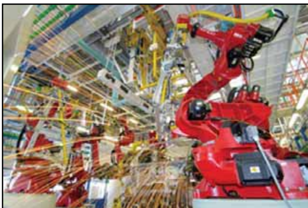
Figure 7: Production flexibility [12]