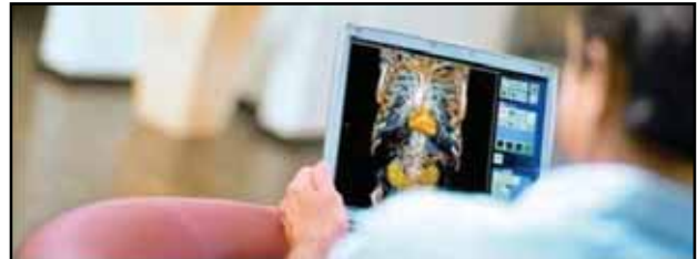
Figure 6: The diagnosis of the patient in the Cloud [11]

made with the base that will help the software to apply and compute statistical and quantitative methods in order to make a diagnosis of patients and by using related cloud services carry out further tasks. On Figure 6 in future cloud computing could be offered by medical image-processing applications and remote diagnostics.