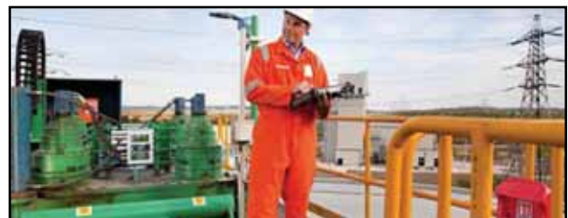
Figure 4: Application access from anywhere [10]

An example is a technician who works in the plant, who uses the tablet computer application to access the site from any point and thus not tied to your job or office. On Figure 4 a heating company technician can use a tablet computer to access the latest maintenance program on site at any time.