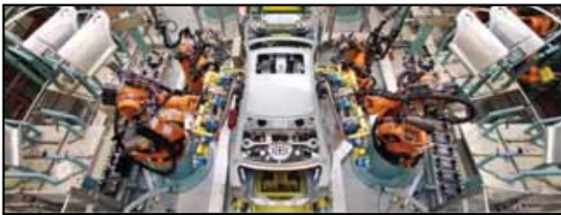
Figure 5: Production monitoring over Cloud [08]

This type of monitoring is very expensive and difficult to maintain due to the huge amount of data that is generated. Microsoft has Azure Cloud platform which monitors these operations. Companies can significantly reduce the cost of their own infrastructure and support with the Windows Azure platform and take advantage of cloud technology. [18] On Figure 5 in some vehicle models there are millions of possible combinations of optional equipment.