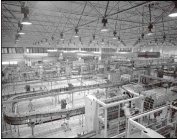
Figure 1: Machines in the production process [07]

we produce and consume. Machines in the manufacturing process must support more features and the human factor must be trained to adapt for market needs. On Figure 1 workers must to prepare for new techniques and working procedures.