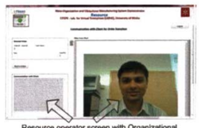
Resource operator screen with Organizational communication controls (message box on left and live video from client or right panel)