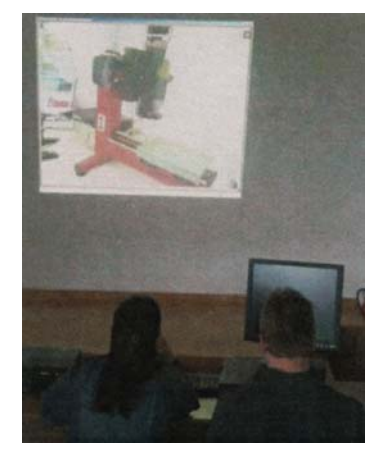
Figure 2. Experiment at the Faculty of Mechanical Engineering, Belgrade, Serbia

As can be seen in Figure 2, the user interface for the remote control functionality has several key components: a) a control