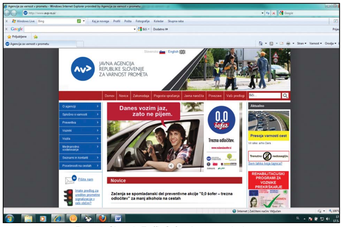
Figure 2: Slovenia Traffic Safety Agency on the internet