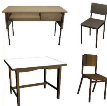
Fig. 6. 3D models of tables and chairs (rendered images)

Mapping is done after modeling basics and all individual elements. The ceiling is different in hallway and classrooms, because one part of ceiling in the classrooms is covered with wood. There are some differences between walls in different classrooms, and in the hallway also. The same material were used, but with different maps. The stairways were defined with two materials, one the same as for walls in the hallway and the other with marble texture. The spiral stairs were done with only one material (wood).