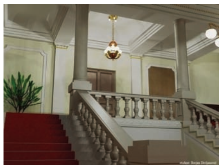
Fig. 4. Stairs and second floor

For all operations it is necessary to define available resources and their purpose. This means hardware and software components.