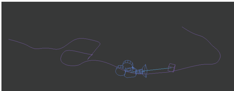
Fig. 7. Camera tracking the path

Lens size is set to 24 mm. This lens gives the best ratio of distortion and viewed space. In this stage of workflow, it is necessary to define additional parameters for animation. Speed and animation length are very important parameters. It is well known that animation length is defined with number of frames, and speed with number of frames per second. It is necessary to adjust these parameters well because it may come to noncontinuous camera movement, even to camera stopping.