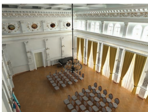
Fig. 14. Conference Hall