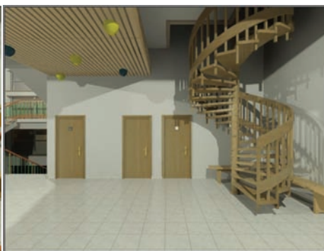
Fig. 9. Spiral stairs

According to one definition, animation is images in "motion". Using timeline, images replace one with another. Every image stays on the screen some amount of time. Animators have to decide how much each image will be held and these produce specific effects. Images have a small differences and that is the way how they join in peaceful and steady movement.