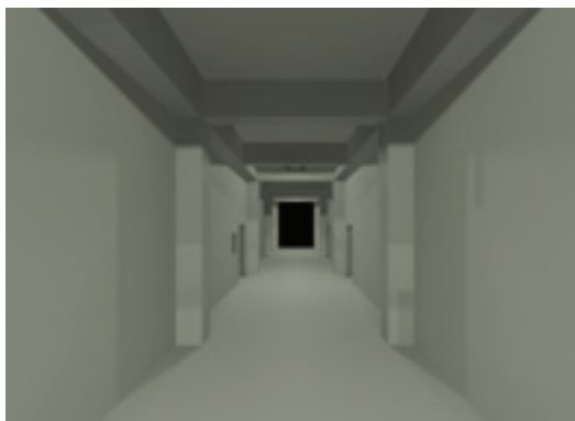
Fig. 5. Hallway base

Modeling should be started with segments that are repeated. In this case, there are a lot of segments that repeats because the classrooms are equipped on almost identical way. Doors, windows, chairs, tables, blackboards are modeled first, and then all other segments (Obradović at all, 2009).