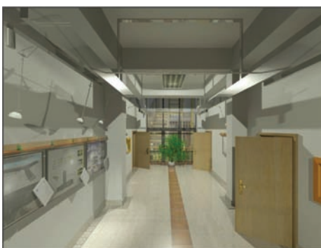
Fig. 11. End of the corridor

The impression of motion pictures is based on physical properties of the human eye. If viewer sees sequence of images in short time interval, previous picture join with the next one and, in the case of movies, we have an illusion of continuous movement. Under reproduction at 24 pictures per second viewer sees smooth illusion of movement.