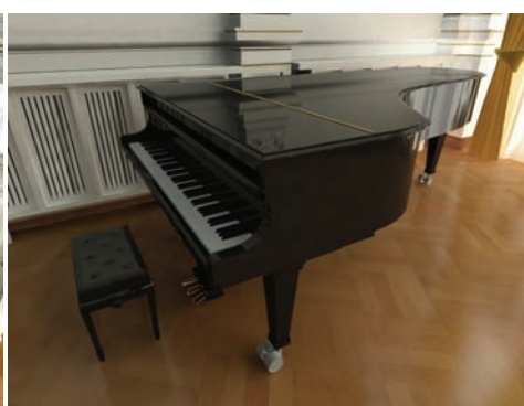
Fig. 15. Piano