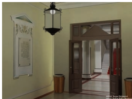
Fig. 1. Entrance of Gymnasium Jovan Jovanovic Zmaj