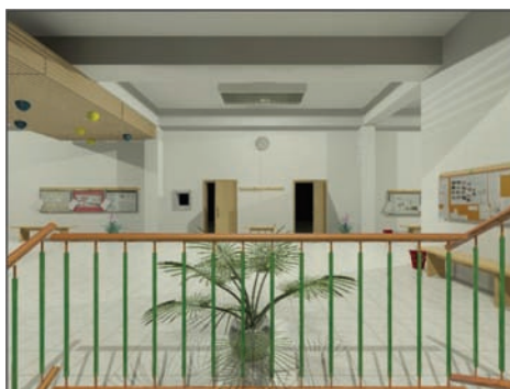
Fig. 8. View on floor at Faculty of Technical Sciences