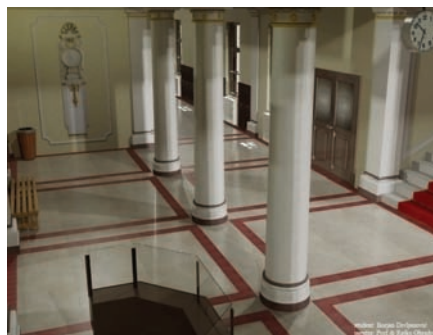
Fig. 2. Basic floor

This is the most important part of the project, which largely affect the quality of final results. The last and not the least important part was brightness adjustment of 3D models, rendering and receiving pictures and movies in the proper format. Operations are conducted in the following order: