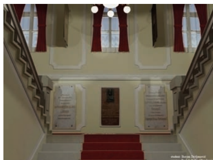
Fig. 3. Stairs