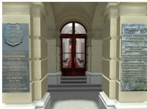
Fig. 12. Novi Sad City Hall entrance