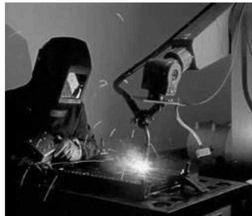
Figure 1: An example of the H - R interaction where a real-time human control of robot welding is presented

each innovative component should be integrated into the system so that it does not pose a possible cause of errors in various conditions of use of robots and for different tasks.