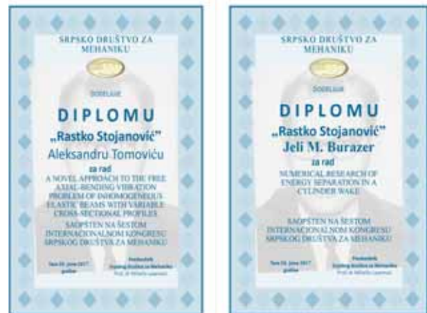
“Rastko Stojanović” diploma