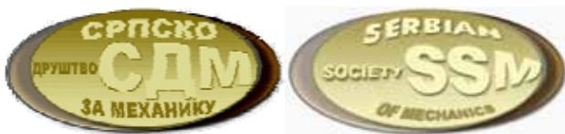
The logo of the Serbian Society of Mechanics

THE International Congress of the Serbian Society of Mechanics is regularly held every second year and comprehensively and multidisciplinary considers current conditions and further development trends in the area of theoretical and applied mechanics. The Serbian Society of Mechanics is a voluntary, non-governmental, non-profit, professional scientific organization with a long tradition, (see http://www.ssm.org.rs/ ).