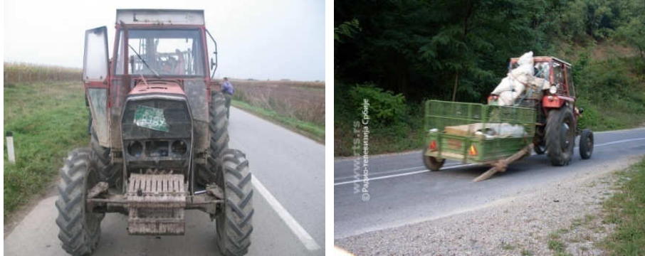
Fig. 3. Defective tractor units in the public transport of Serbia, [9], [23]

On the basis of the data presented, it can be concluded that there is a slightly decrease in the number of fatalities in accidents with tractors in the period 1990-2009. The reason for reducing the number of people killed, in addition to the human factor is the influence factor of improving the technical characteristics of modern machinery and the tractors that are all over-represented in agriculture of Serbia (additional safety devices, cab signaling and alarm systems, etc.).