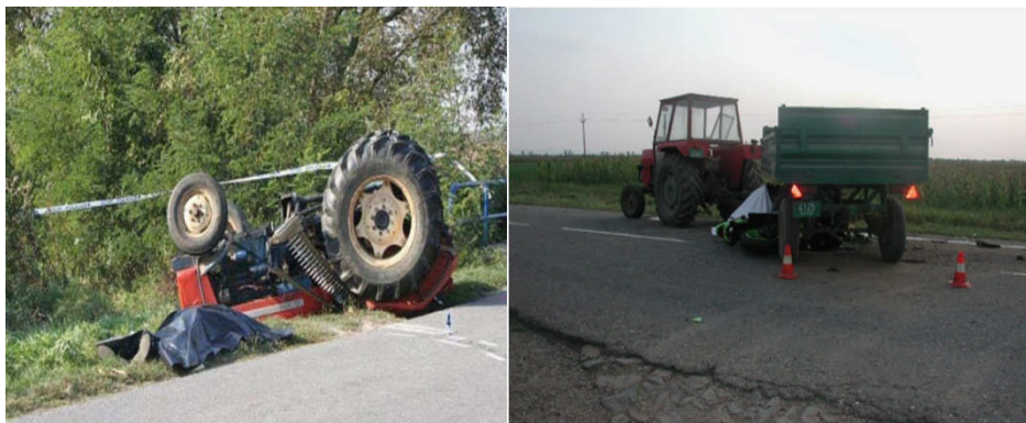
Fig. 1. Accidents with tractors and their tragic consequences, [22]

According to research data [8-10], in Republic of Serbia, in the period 1980-1988, over 900 tractor drivers (approximately 112 per year) were killed in various accidents and the locations (the movement of the tractor, down, or side-slope, improper towing tractor defective, others ride in a tractor in places that do not have a seat, driving speeding, rolling over, etc.). In direct accidents in public transport in Republic of Serbia (without provinces) from 1990 to 2000, the average number of tragically killed tractor drivers was 76 people.